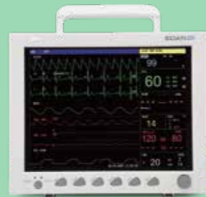
iM8 Series Patient Monitor