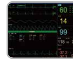
OxyCRG for Neonate