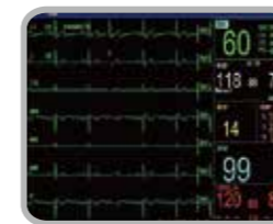
3/5-lead ECG Analysis