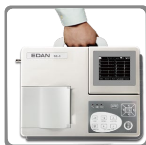
Portable Design (Handle Optional)