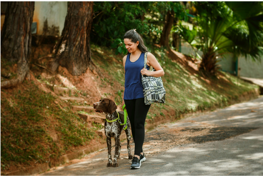
Durham steps at a brisk pace. Morning traffic toward RTP, late evenings at Duke or the hospitals, evening classes, young people sports timetables layered on top. Pet dogs feel that rhythm too, particularly when their people are in and out at strange hours. A