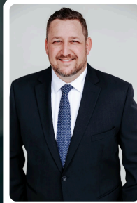
Santa Maria, CA

ile crash, your life modifications in a split second, and we are