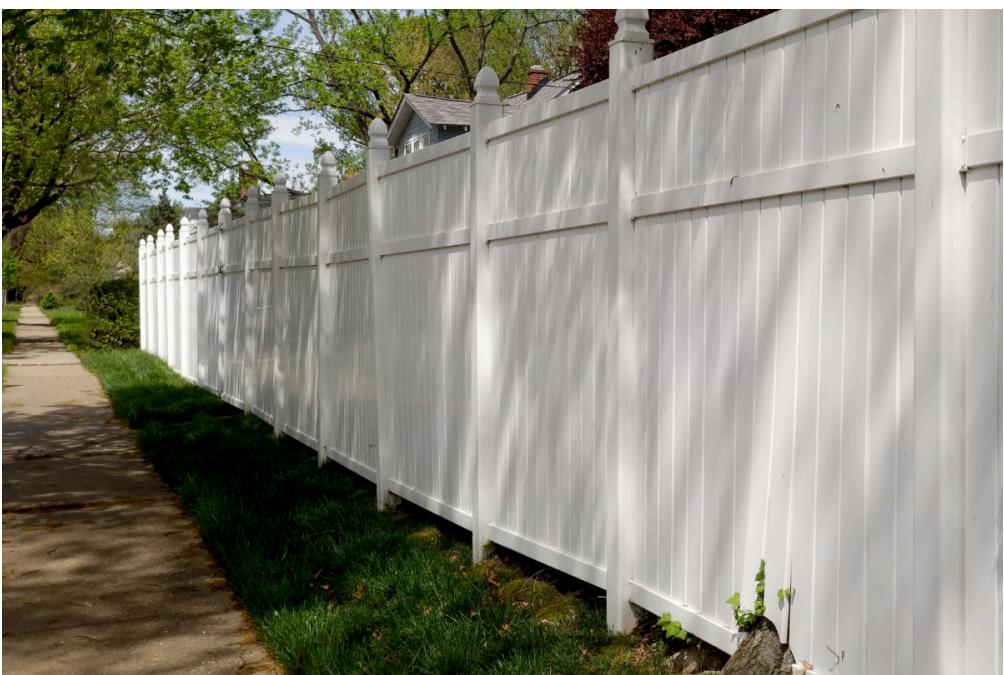
An excellent vinyl fencing ought to fade right into the background of your day, doing its task without dramatization. In Santa Ana, that silent integrity gets checked. The sunlight is unrelenting the majority of the year, winter season brings a few soaking tornados, and the Santa Ana winds can transform a common mid-day right into a stress test. When a panel burn out, a gateway sags, or a